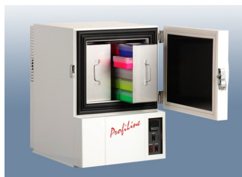
ProfiLine Pegasus PLPE 0486 (With accessories Inventory Systems. See sep. brochure.)